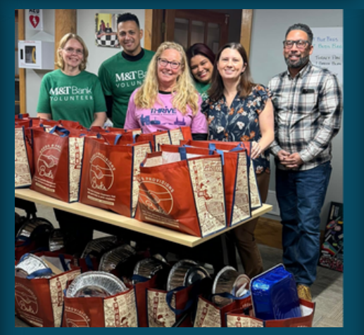
'GRATEFUL HEARTS, SMILING FACES'

If interested, email fsactivities@icanthrive.org